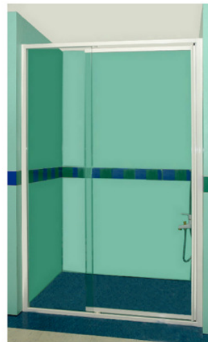
SLSP: ShowerLux Pivot Door with a Side Panel