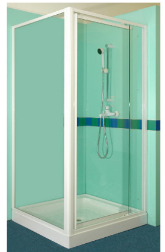
SLSP 1R90: ShowerLux Side Panel with a Return Panel