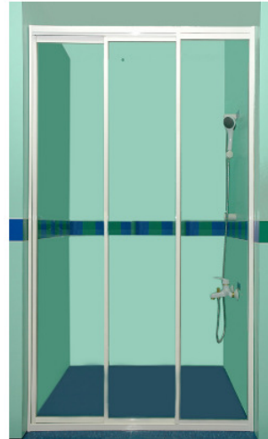
SD3: Wall-to-Wall Sliding Enclosure