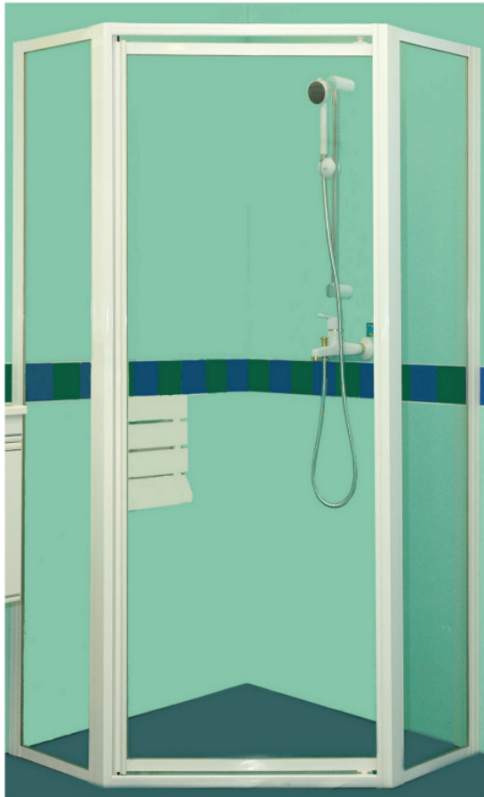
SLDP: ShowerLux 135 Pivot Door