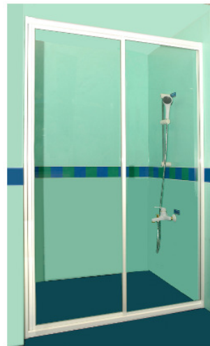
SL2: Sliding Shower Enclosure