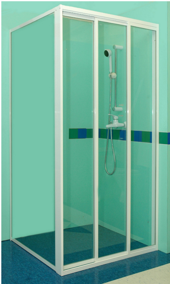
SD3: Wall-to-Wall Sliding Enclosure with a Return Panel