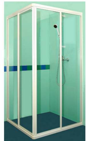
CE2: Corner Entry Enclosure