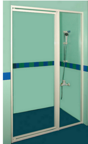
SLFP: ShowerLux Pivot Door with a Framed Panel