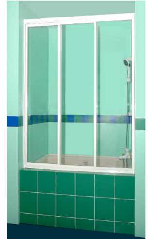
BD3: Long Bath Enclosure